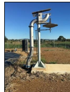
Weighted flaps