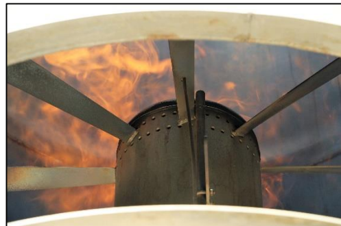
Flare burning methane

A major advantage of CAL technology is that the captured biogas is flared into the atmosphere or combusted for on-site energy generation, which reduces emissions by over 97%.