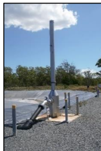
Water seals or hydrostatic valves