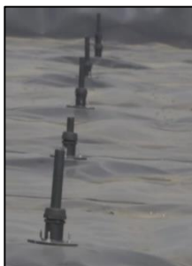
Simple pipe spears