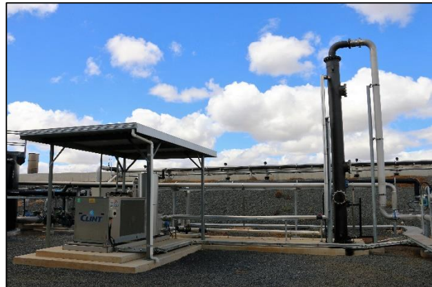
Stripping tower and dehumidifier