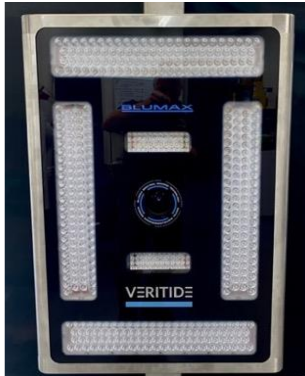
Figure 1: Commercial Version of Veritide’s Single Module BluMax Scanner